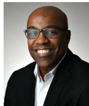
Sen. Kwame Raoul