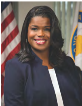
Hon. Kimberly M. Foxx